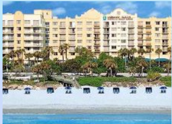
Embassy Suites, Deerfield Beach

The Conference hotel, Embassy Suites by Hilton Deerfield Beach Resort & Spa is one of the best Deerfield Beach hotels on Florida's Gold Coast. Located between Boca Raton and Ft. Lauderdale, enjoy two miles of Florida's white sand beaches, accessible from the walkway. Come to BT's Oceanfront restaurant for a free made-to-order breakfast--savor a custom omelet with coffee and ocean views. Enjoy a cocktail and snacks at the complimentary Evening Reception. Experience the tropical heated pool or wading in the Atlantic, just steps from the resort in Deerfield Beach. Relax with an aromatherapy bath or massage at Spa950. The 3,300 sq. ft. spa includes a full-service salon. This resort near Delray Beach is 18 miles from Ft. Lauderdale International Airport and 23 miles from Palm Beach International Airport.